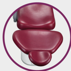
Ergonomic Design PU Upholstery