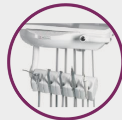
Assistant Instrument Table