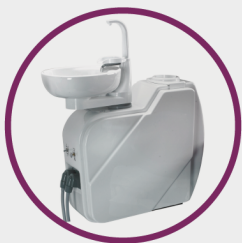
Rotatable Spittoon Unit